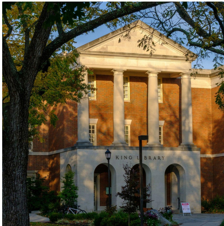
King Library (Main location)

Art & Architecture Library (~ 75,623 items)